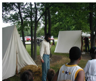
The troop ran into this Civil War re-enactor while camping at East Harbor and Kelley's Island several years ago.