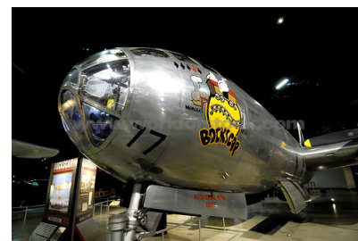
Ask Cooper what kind of plane this is...I'm just the newsletter editor.

ful directions to our campsite for the night. We ended up camping at a very nice location, with a solid shelter, firm ground, and even indoor bathrooms and a playground. Naturally, we were informed the next morning that we were in the wrong location. Yet still we soldiered on! We were instructed to pack up our gear and tents (in the rain, mind you) and move to the designated "Scout camp." After one glance at the Scout camp we decided to postpone our arrival. Instead, we set out to explore the Air Force Museum, and with the exception of a few fiscal pacifists, everyone had a great time. And anyone who walked around the museum with Cooper, the