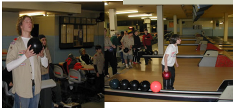
Some photos from the last time the troop went bowling on a campout, in 2005